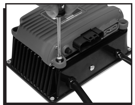
Figure 3 Mounting

Wire Length: All of the wires of the MSD Ignition may be shortened as long as quality connectors are used or soldered in place. To lengthen the wires, use one size bigger gauge wire (10 gauge for the power leads and 16 gauge for the other wires) with the proper connections. All connections must be soldered and sealed.